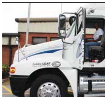
CDL Truck Driving