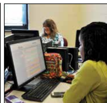
Medical Office Specialist