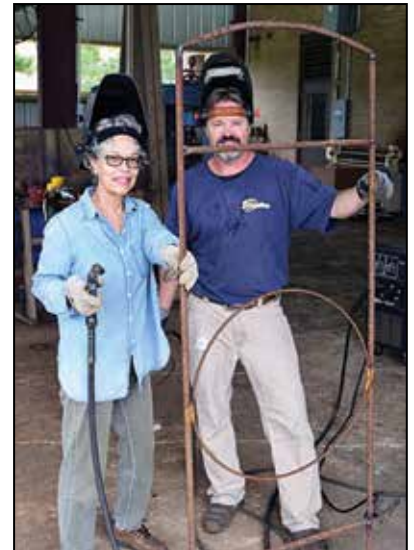
Welding for Fun