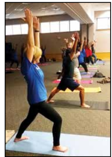
Fitness...Yoga & Tai Chi