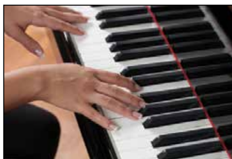
Music...Learn to Play