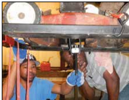
Small Engine Repair