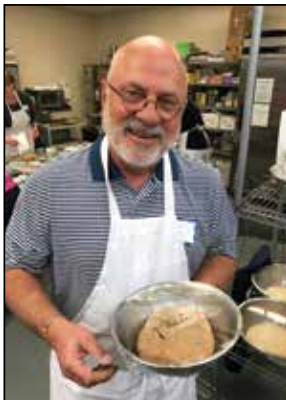
Culinary Arts for Fun

6:00pm-9:00pm Tuesday May 8 Fee: $40 3 hrs 30117 BCCC8 830