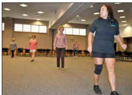
Dancing...Line and Shag