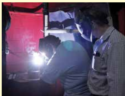
Welding for Fun