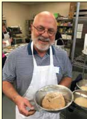
Culinary Arts for Fun