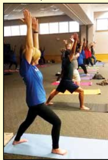
Fitness...Yoga & Tai Chi