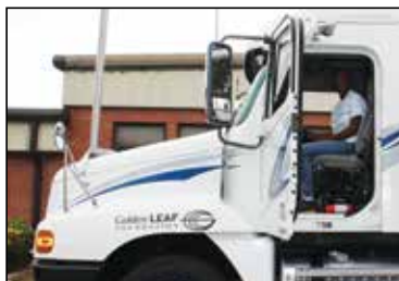
CDL Truck Driving