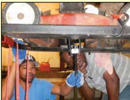
Small Engine Repair