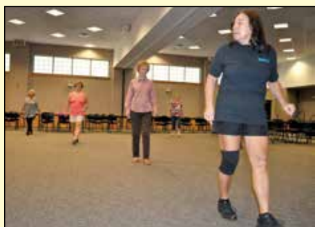
Dancing...Line and Shag