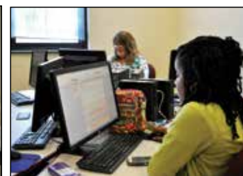
Medical Office Specialist