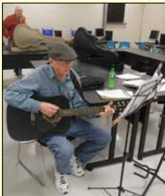
Music...Learn to Play